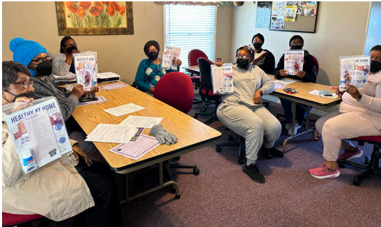
H.O.P.E. Ambassadors have recently completed surveys and handed out COVID19 informational flyers at several locations in Pickens and Sumter counties.