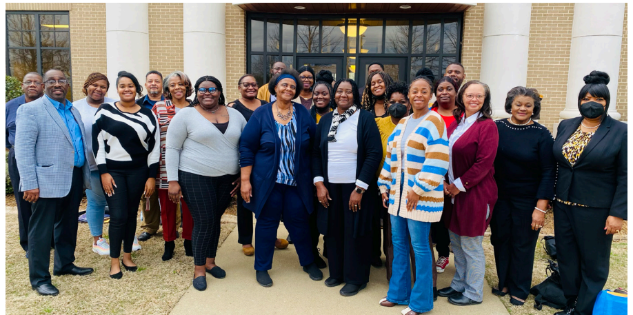
H.O.P.E. Ambassadors & Community Coordinators attended a two-day curriculum training the first week of February at Wallace Community College.