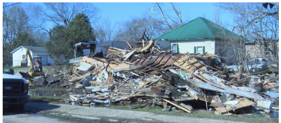
Selma tornado recovery cleanup efforts. Source: wsfa.com (5/2/2023)