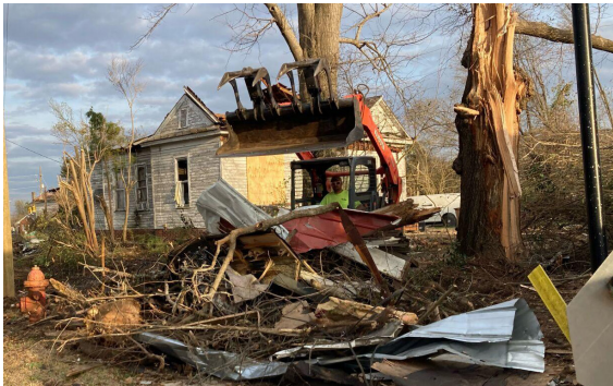
Crews work to cleanup storm debris from January 12th tornado in Selma.