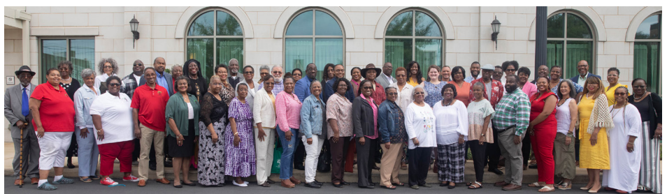
Community Associates gathered for group photo at the 2023 Retreat.