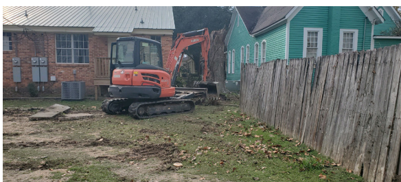
Work is currently being completed on the exterior of the building, including getting the new parking lot ready for paving and building new fences.

"By incorporating the works of Black Belt and other southern artists, community members will hopefully see themselves and their history reflected in the best light possible when they visit." – Felecia Lucky, BBCF President