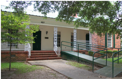
The front of the 410 Church Street building includes a large porch area accessible via stairs and a ramp for wheelchair access.

The BBCF is very near to having a long-anticipated dream come true, just in time for the 20th anniversary of the organization. The new headquarters at 410 Church Street in Selma, AL will replace BBCF's current location on Lauderdale Street, and will house staff, including Head Start administration.