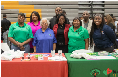
BBCF Community Associates, H.O.P.E. Ambassadors, and staff represented the foundation and distributed resources to attendees at the Day of Action in Selma, AL.

with BBCF and other non-profit, business, and governmental agencies to combat poverty by connecting community to resources.