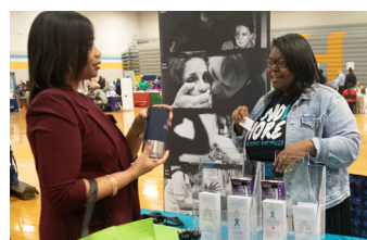
Attendee interacts with vendor, collecting resources and giveaways at the event.

The Day of Action was designed to coincide with the anniversary of the January 12, 2023 tornadoic event that devastated the city of Selma and numerous counties in West Alabama. Although the event had to be postponed until February due to the threat of severe weather, the collaborative, community effort provided impactful resources for those most in need. If you would like to support the BBCF's ongoing efforts to aid Black Belt communities, consider donating at blackbeltfound.org/donate . Sources: wsfa.com (2/2/24); bullockal.com