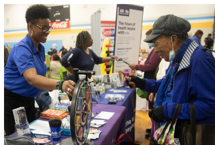
Attendee plays a game at a vendor's booth during the event.

The Black Belt Community Foundation (BBCF) was honored to co-sponsor the Selma Day of Action on February 2, 2024, in the gymnasium of historic Selma High School. The purpose of the Day of Action was to offer resources and direct assistance to those transitioning out of poverty in Selma and Dallas County. WSFA 12 News, as part of their Raising the Bar, Overcoming Poverty series teamed up