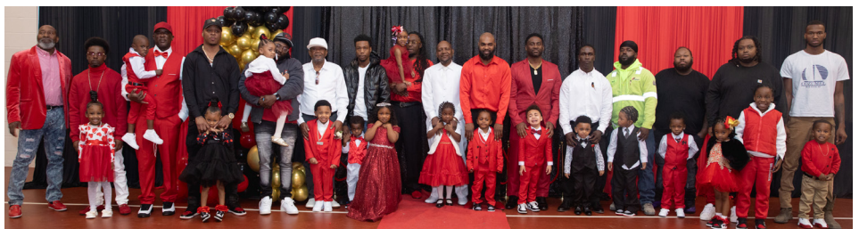
Group photo of families in attendance at the GP Austin Head Start Valentine's Day Sneaker Ball in Linden, AL.