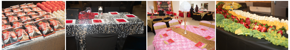
The Sneaker Ball events included themed snacks and treats for the kids, gorgeous and sparkly table decorations and healthy food options.

These events include the entire family by offering a celebration where participants adorn their dressy outfits with their "best sneakers". Sidney Hardy, Head Start data coordinator and one of the event organizers offered, "the staff and parents came together to provide fun and fancy, localized events for each campus, complete with customized BBCF swag treats for attendees."