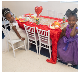
HS Students all dressed up for the ball!

Since 2017, BBCF has operated 6 Head Start programs for pre-school children in the Black Belt. These federally funded programs offer an early learning curriculum that emphasizes language, literacy, social skills, emotional well-being, health, nutrition, and family engagement.