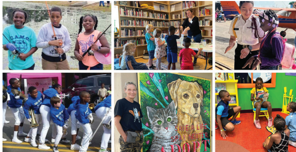
Collage of photos from 2023 Arts and Community Grant recipients.