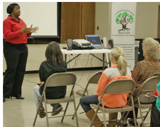
Photo archive: In-person BBCF Grant Seekers workshop conducted in 2007.

For a more in-depth learning experience, covering all aspects of the BBCF grant process and including tips for writing a successful application, please plan to attend one of the two Online Grant Summit workshops. April 19th is the deadline for all applications, with final decisions being tendered by the end of May 2024.