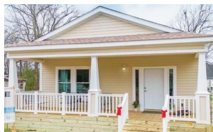
This beautiful home, located at 1425 Washington St., will be awarded to the winner of a lottery selection held on Sunday, April 21, at 3pm. For more info call: 414-301-3826

As part of their inspired approach, SHA partners with the City of Selma, along with local non-profits and businesses, to support a variety of community needs. Two examples of the exceptional initiatives the SHA has put forth are the Annual Build-A-Bed Giveaway project and the Perfect Attendance Incentive. In July of 2023, the SHA staff distributed new bedroom and living room furniture to residents who desire to enhance their homes and need a helping hand. This initiative, which began in 2019, has become one of the housing authority's most meaningful programs. The Perfect Attendance Incentive is a newly announced project from SHA that will give the families of about 300 students, living at four local housing complexes, a chance to win a $500 incentive if their child maintains perfect attendance throughout the school year. This initiative, funded by the BBCF, seeks to reduce truancy by teaching children the importance of attendance and being on time, which will help them become better citizens in the community.