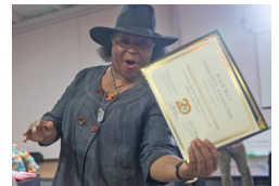
Grantee shows off her grant award during the ceremony on June 1, in Selma, AL.

An audience of nearly two-hundred witnessed BBCF's distribution of over half a million dollars to community and arts organizations throughout the 12 Black Belt counties served. A total of $359,693 in community grants was given to 96 organizations. Thirty-four arts grants were funded for $154,740 (for a total of $514,433).