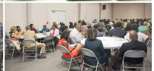
Top: Delicious assortment of food at the ceremony, provided by Lizzy Carrie Deli & Catering from Selma, AL. Bottom Left: Lowndes County Grantees pose for photo with BBCF Admin and Staff at the June 1st Grants Ceremony. Bottom Right: View of the 190+ person crowd in attendance at the 2024 BBCF Arts & Community Grant Awards Ceremony.