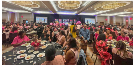
Crowd in attendance at the 2024 Black Girls Dream Conference.

A striking scene evolved in a cloud of pink joy when over 1200 delegates converged at the Southern Black Girls Dream Conference, held at the Marriott Marquis, downtown Atlanta, June 6-8, 2024. Sponsored by the Southern Black Girls and Women’s Consortium (SBGWC), this full-fledged conference was designed to help youth claim their vision, practice leadership, community organizing, health and wellness, fuel entrepreneurship and pursue STEM dreams. Black girls and gender expansive youth and women were catapulted into a sea of possibilities based on vision. The SBGWC, led by three anchor organizations serves Black girls and women across 12 southern states by giving them access to knowledge, skills and self-efficacy as they fulfill their vision.