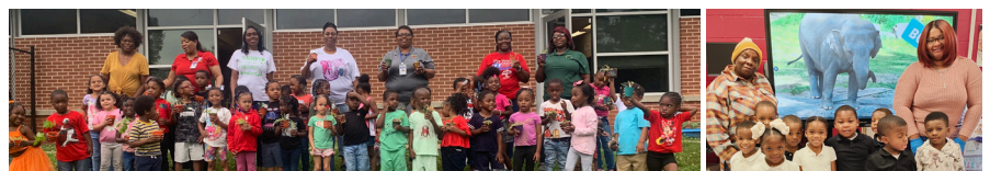
Current BBCF Head Start teachers and staff in action! Left: Marengo County HS teachers and staff helped students plant flowers for their moms for Mother's Day 2024. Right: Choctaw County HS teachers guided students through a virtual trip of the Smithsonian National Zoo in May 2024.